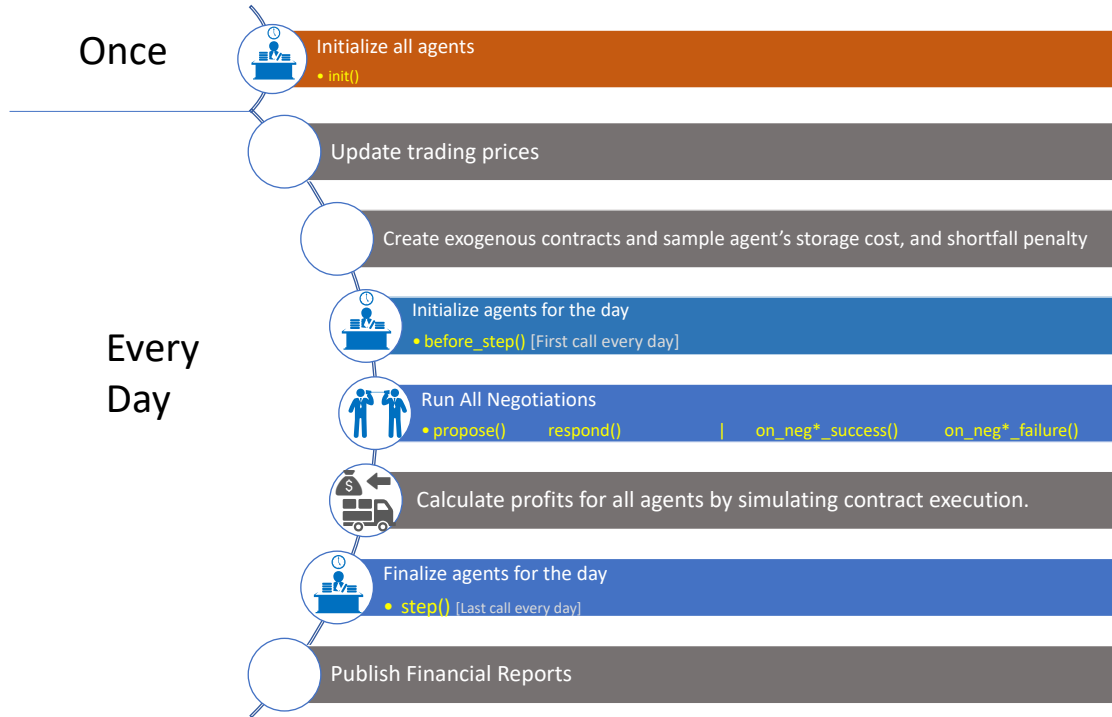
Figure 3: Order of execution of events during a simulation.

All SCM agents implement an initialization function and a step function. The former is called by the simulator to initialize agents' behavior, before day zero. 10 After initialization, the simulator repeats the following loop every day, which calls the agents' step functions, among other things (see Figure 3):